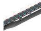
Road and Flyovers