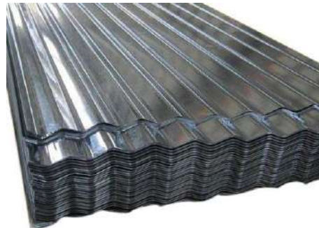
GI CORRUGATED SHEET